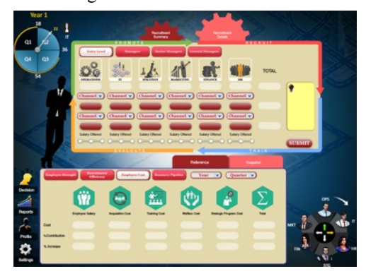
Figure 1. Decision Form - HR

The player who dons the role of a HR in the game, as identified in the domain modelling layer would have the options to recruit people by deciding the number of people at various designation, salary to be offered and the channel from which they would be recruited from. The player also has the option to choose various training and welfare programs, offer promotion, manage attrition and have the power to retrench people.